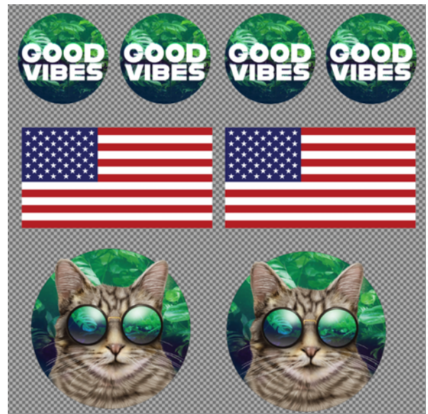
Example of one design file (gang sheet) that is 22" x 22" and includes multiple design images