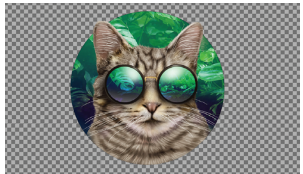
Example of one single image that could be uploaded