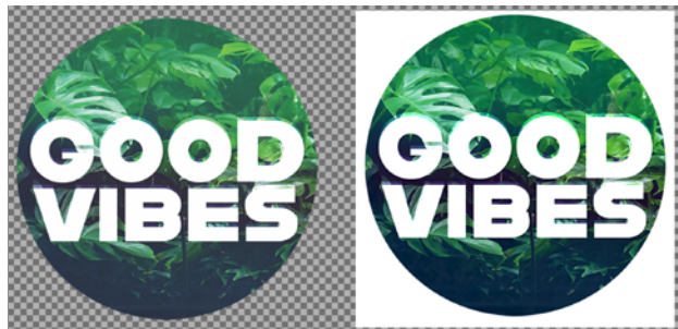
.PNG with a transparent background