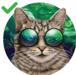
Good Hard edge