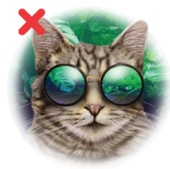
Bad Soft edge